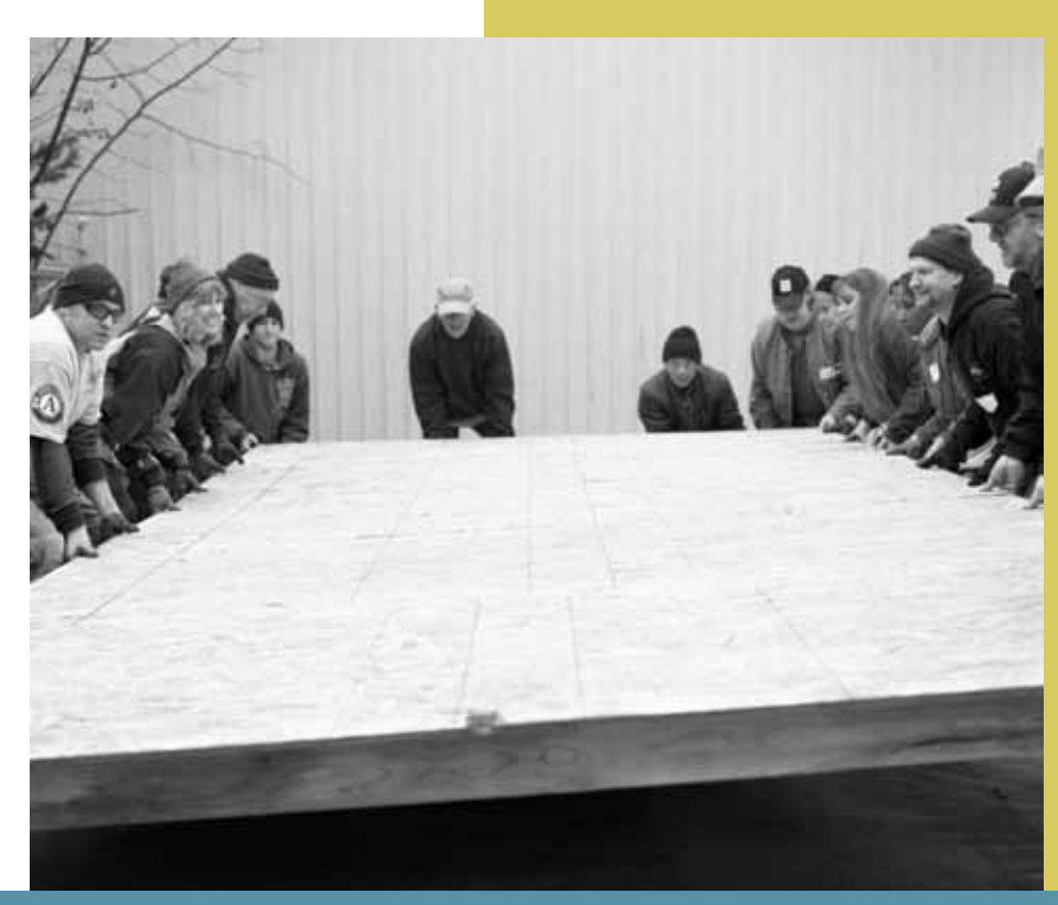
Homeowners from the southeast Martins Street community help raise the walls of their homes with volunteers on a cold January day.

After a 1% down payment, families purchase the Habitat home at cost with a 0% interest mortgage, creating long-term stability.