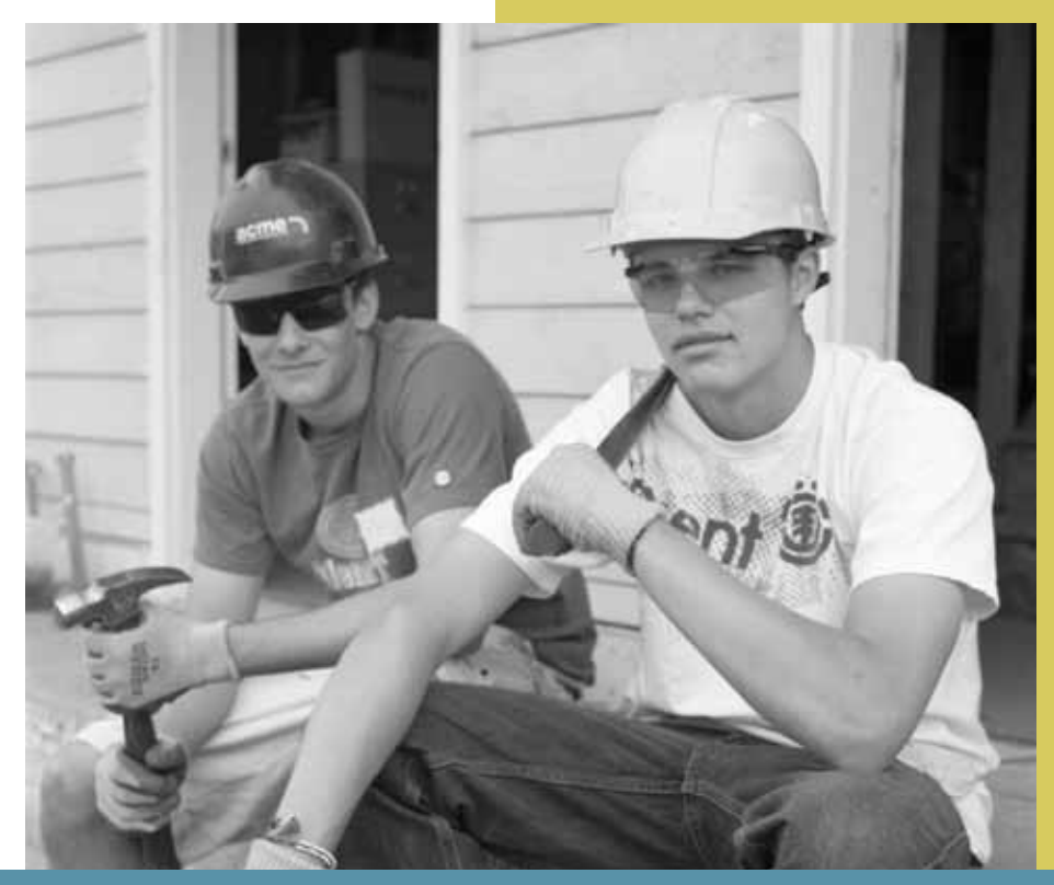
Acme Construction Supply Co. provides Habitat with store credit to purchase and repair tools.

There are many sponsorship levels, from a $1,500 corporate Team Builders' day to a home sponsorship at $60,000. Many thanks to the companies (listed at the back) who partnered with us this year!